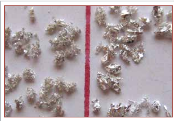
Notice how the rugged surface are of KAR silver crystals on the left side are larger than competitor and vendor E on the right side. (Red line is 0,5mm.)

Using KAR silver crystals will save substantial reduction in installed weight of silver or reactor and still achieve larger catalytic surface area.